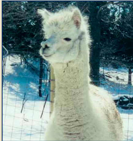
Home of Hummer

Blue ribbon winner at the Big E 2000, son of '3Peruvian Fortissimo', bevy of blue-ribbon winner. Crusader is herdsire to dark-colored crias, admired for their confirmation and fiber.